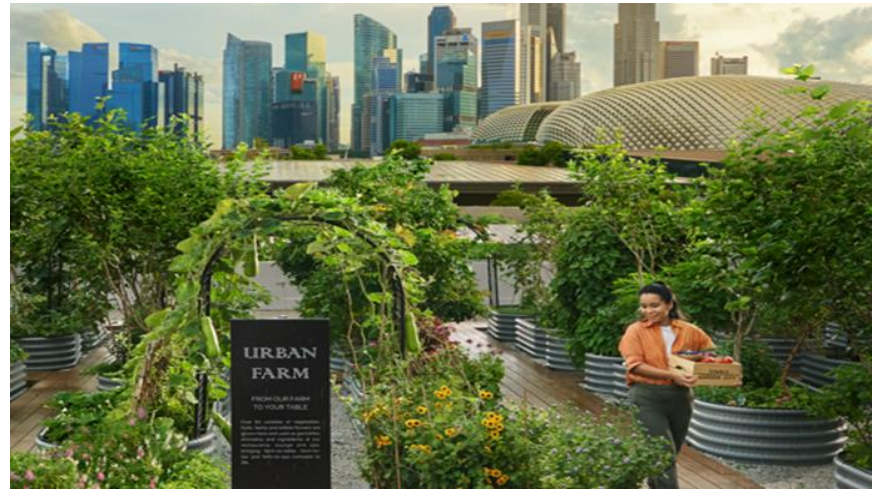
Farming. Made in SG "Farm to Table Workshop"

Insta-Worthy Spots. Made in SG "Instagram Walking Tours"