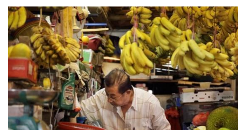
Wet Market (Frischprodukte-Markt)