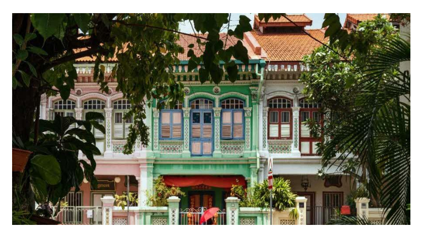
Shop Houses in Katong