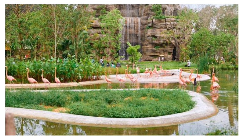
Bird Paradise @ Mandai