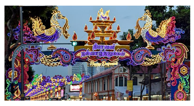
Little India (Deepawali Lichterfest)