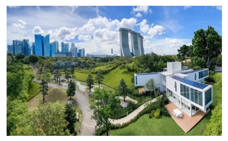
Garden Pods at Gardens by the Bay