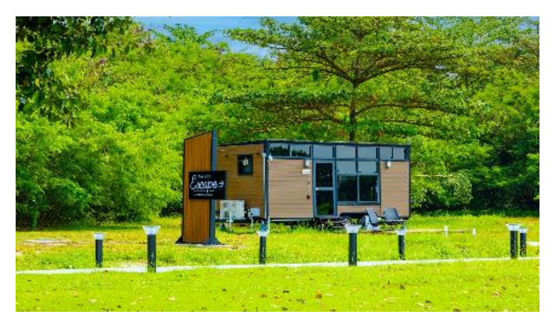
Tiny Away Escape @ Lazarus Island