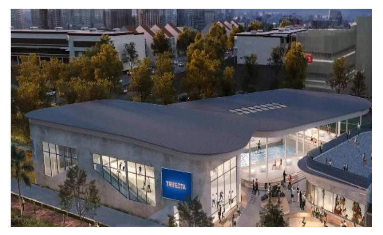
Trifecta Orchard Road