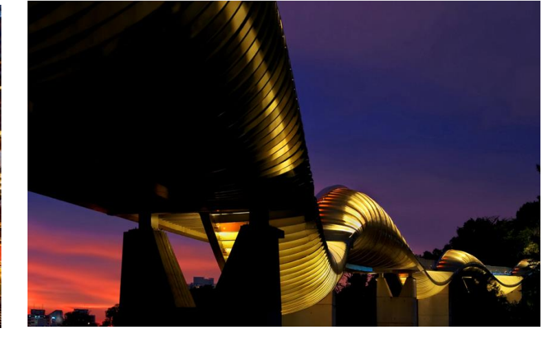
Henderson Waves Bridge