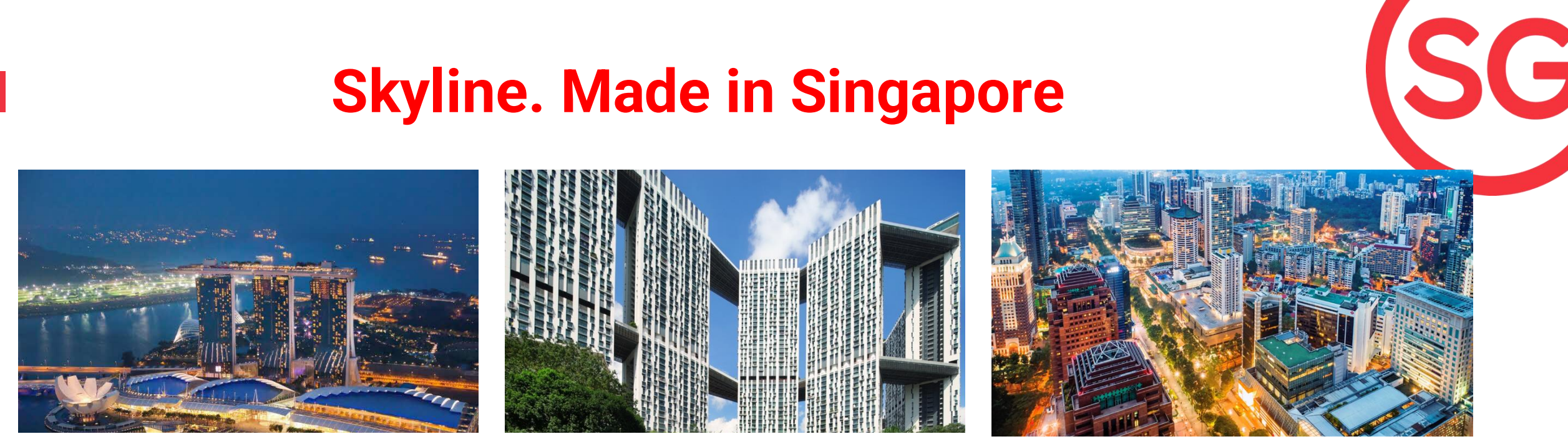
Marina Bay Sands