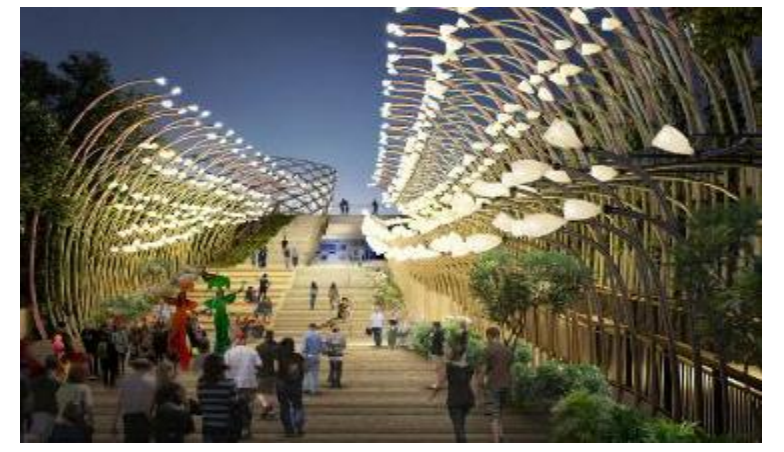
Sensoryscape Walk & Garden @ Sentosa