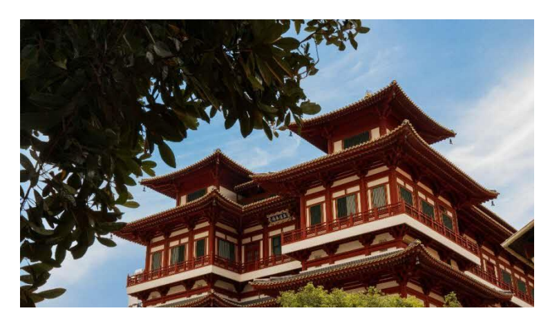
Buddha Tooth Relic Temple, Chinatown