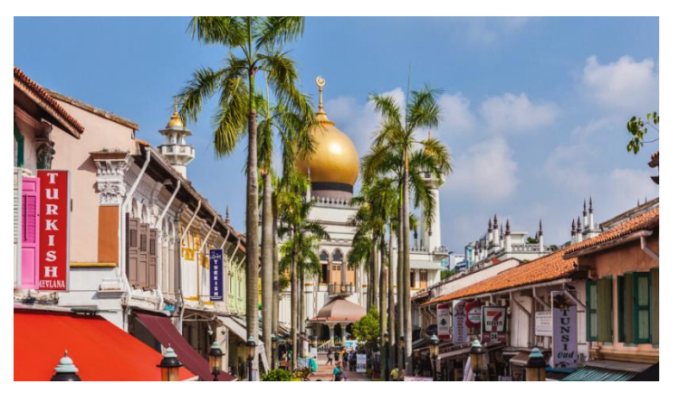
Sultan Mosque, Kampong Gelam